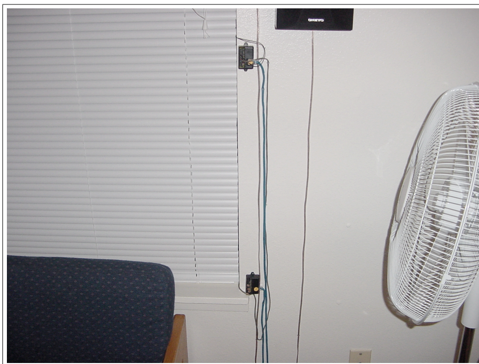
Figure C.6. ArgusMS Dongle sensors by the window near an X-10 controlled floor fan.