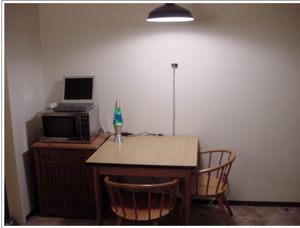
Figure C.2. MavPad dining room.