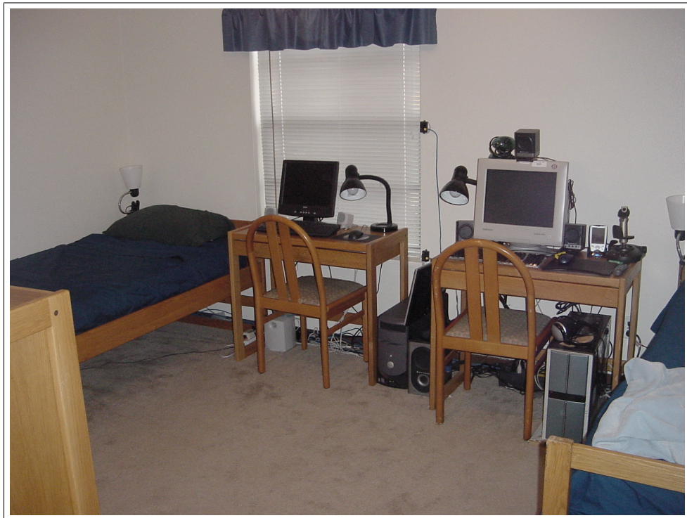
Figure C.4. MavPad bedroom.