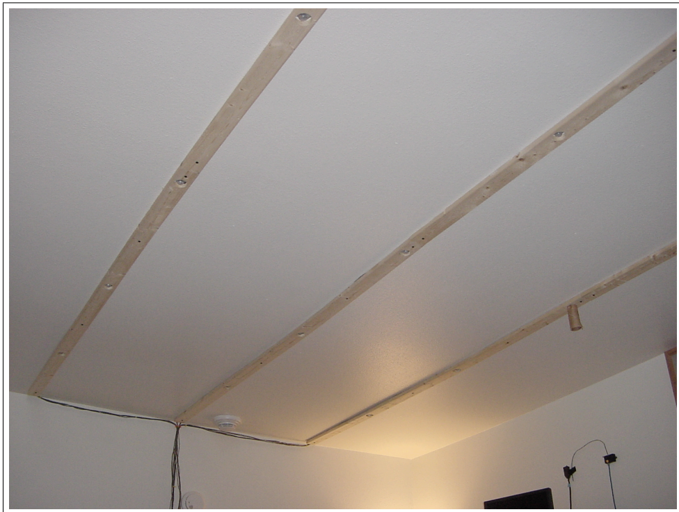
Figure C.7. ArgusD ceiling mounted PIR motion sensors.