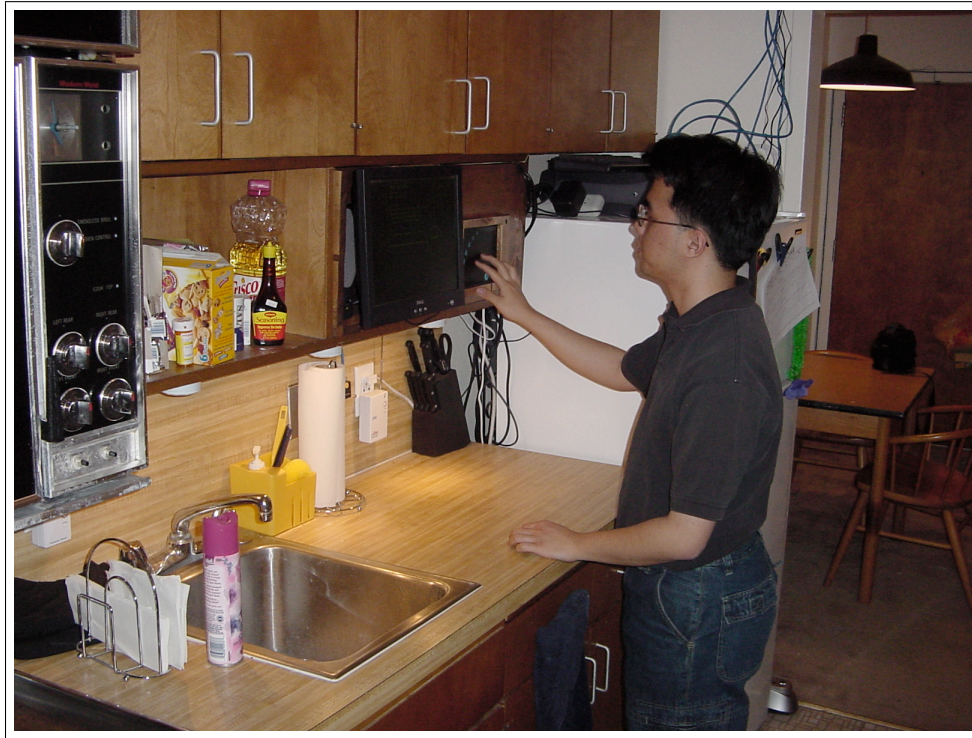
Figure C.3. MavPad kitchen.