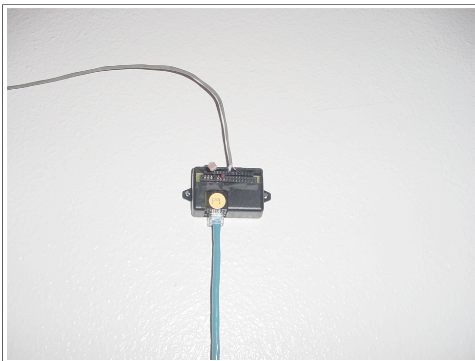
Figure C.5. ArgusMS Dongle on the wall.