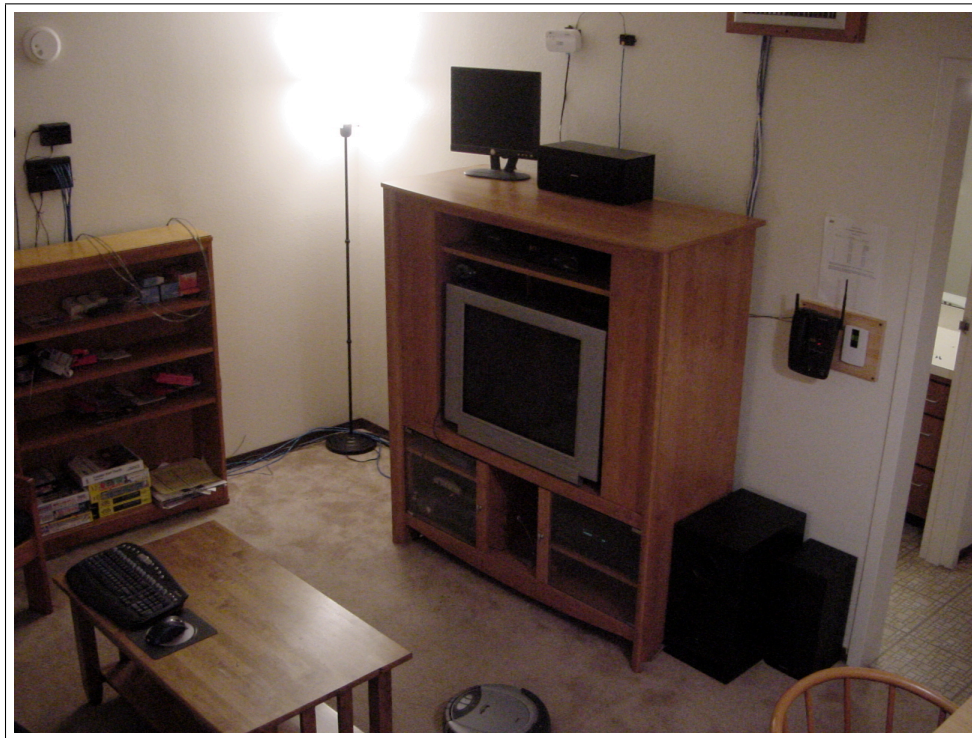
Figure C.1. MavPad living room.

The MavPad is an on-campus student apartment located at University Village on The University of Texas at Arlington's campus. The apartment consists of a living/dining room combination, a kitchen, a bathroom, a large bedroom, and a walk-in closet. The living room is shown in Figure C.1 and the dining portion is shown in Figure C.2. The kitchen is small and shown in Figure C.3. The bedroom supports two people and can be seen in Figure C.4. The bathroom contains a sink, toilet, and a shower. The bedroom closet is large enough to hold clothes as well as computer equipment including the network routers and our master server.